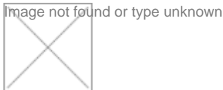
Figure 2 contains the interconnections among WPs.